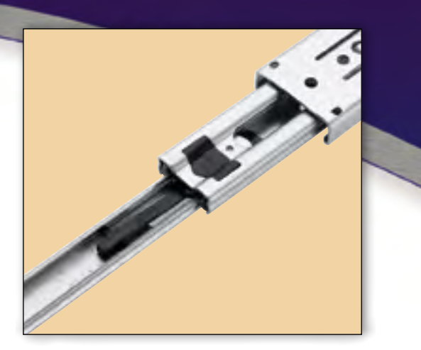
Unhanded push latch disconnect