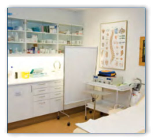
Medical cabinets or carts